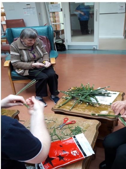
St. Brigid's Crosses

On 1st February 2017 our residents busied themselves making St. Brigid's Crosses. The crosses were blessed and placed in all their rooms. On Valentine's Day a tree was erected in the day room where the residents hung love hearts which they made in memory for their loved ones past and present.